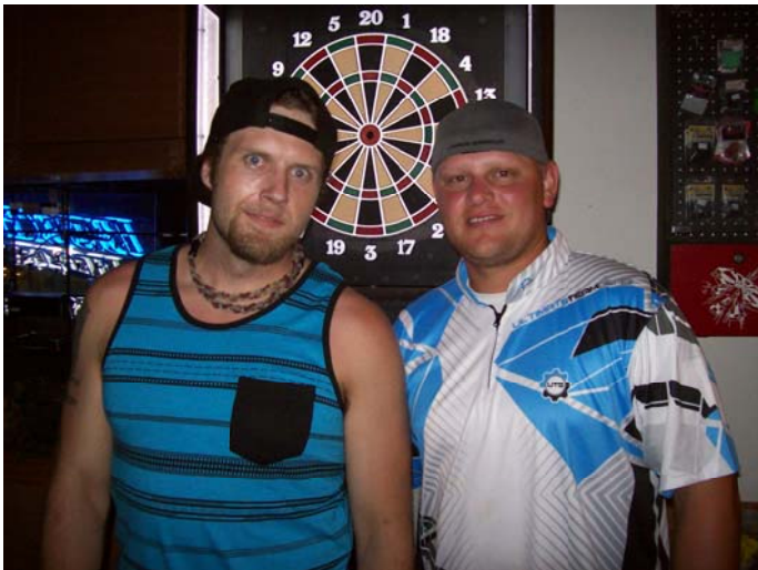
DON'T U WORRY (GRACE LAKE BAR) 2 ND PLACE END TOURNAMENT