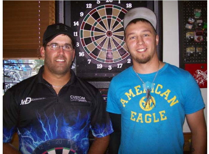
ELKS CLUB #3 2 ND PLACE SEASON AND 3 RD PLACE END TOURN.