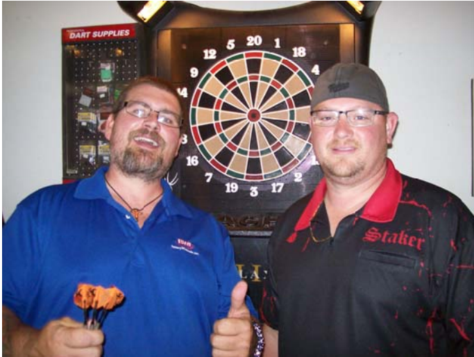
THE OTHER GUY'S (ELKS) 1 ST PLACE SEASON AND END TOURN.